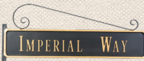
Hanging Frame with Scroll Arm