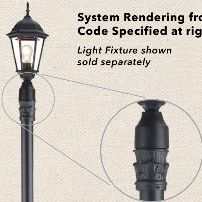
TP 1 (transition piece)